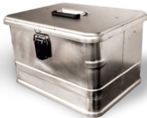
ALUMINIUM BOX FOR SAFE TRANSPORTATION