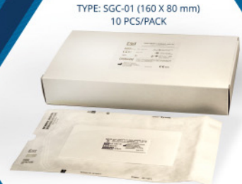
TYPE: SGC-01 (160 X 80 mm) 10 PCS/PACK